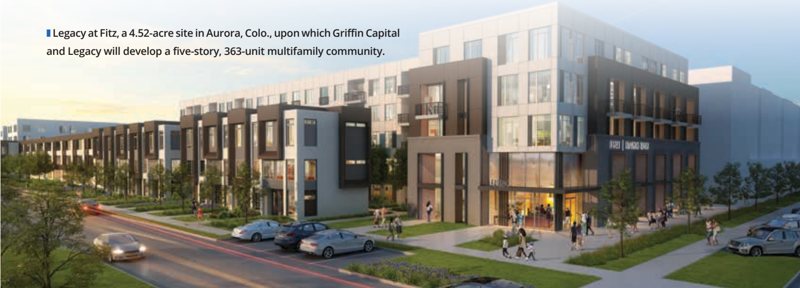
■ Legacy at Fitz, a 4.52-acre site in Aurora, Colo., upon which Griffin Capital and Legacy will develop a five-story, 363-unit multifamily community.

Investors do not simply invest on their own. They must make all investments through a qualified opportunity fund (QOF), an investment vehicle organized as a corporation or partnership. An investor must invest the capital gains into a QOF within 180 days of the original asset sale.