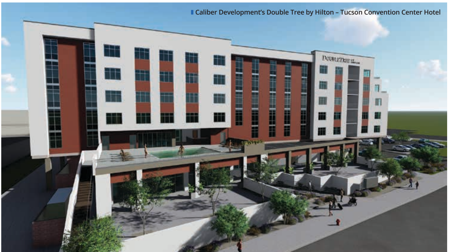
■ Caliber Development’s Double Tree by Hilton – Tucson Convention Center Hotel

Clearly, not all opportunity zones have similar appeal. Some areas are already on their way to revitalization, while others will likely remain blighted for the next 10